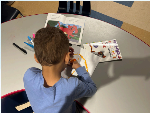
RIF student drawing Clifford after reading a book about the Big Red Dog.