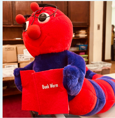
Book Worm engrossed in a thriller!

The Reading Is Fun Is Program, Inc. is grateful for tax-deductible monetary donations supporting our organization. A gift to RIF to honor someone, in memory of someone, or to commemorate something is a special way to show you care. To contribute, please write your check to "The Reading Is Fun Program, Inc.", & mail it to The Reading Is Fun Program, PO Box 9437, Schenectady, NY 12309 . Thank you for your consideration.